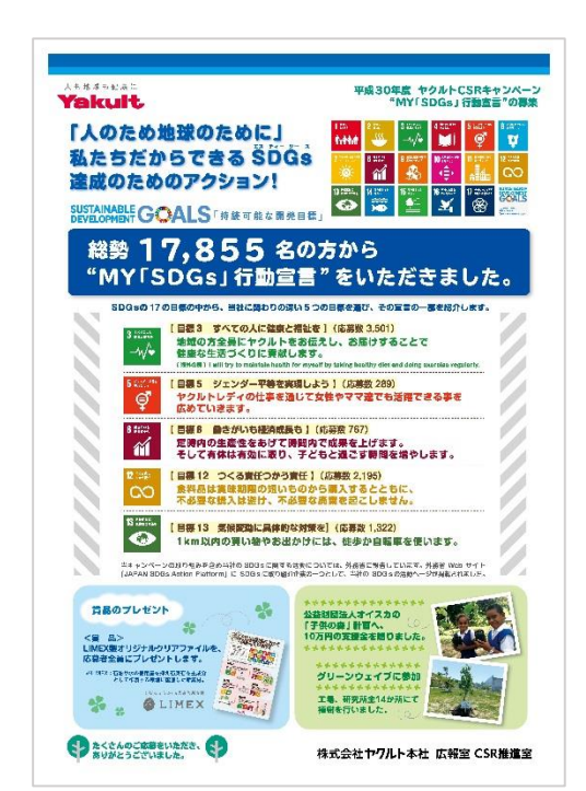
Reference 2: Yakult CSR Report 2018 https://www.yakult.co.jp/english/csr/eco/report/index.html

Yakult introduces its corporate activities and their relationship to the SDGs in the Yakult CSR Report 2018.