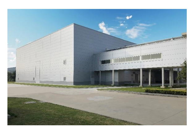
Exterior of Plant Building 2, the Wuxi Plant